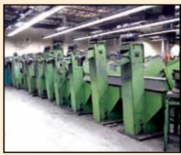
WARREN BULK LOADERS