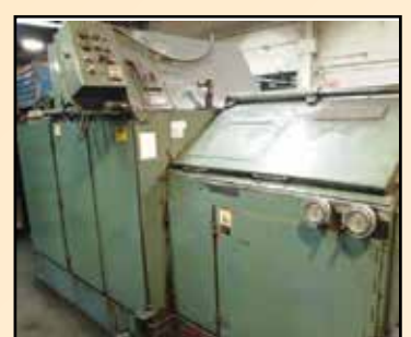
NATIONAL HS HEADERS