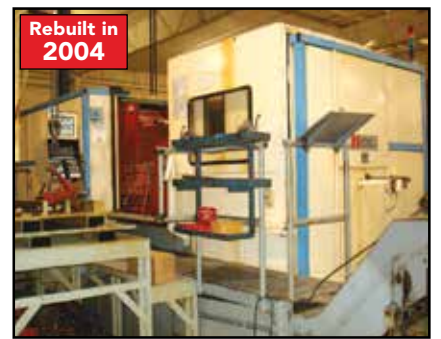
5/8" NATIONAL FORMAX 54-L, 4 DIE 4 BLOW LONG STROKE COLD FORMER

FEATURING: Well Maintained National Cold Parts Formers up to 1", Formax Long Stroke Multi-Die, Many 2 Die 3 Blow Headers, Medium and Long Stroke Single Die Cold Headers, High Speed Thread Rollers, some with Washer Assembly Systems, Bolt Trim Presses, In-Line Wire Drawers, Automated Late Mdl. Fastener Washing System, Air Cleaning Systems and Much Much More!