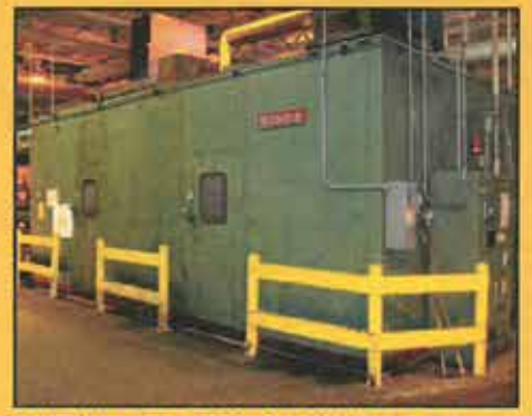
1" NATIONAL 5 DIE 6 STATION COLD FORMER YEAR 1982

All Well Maintained, American Made Machinery, Still Under Power!