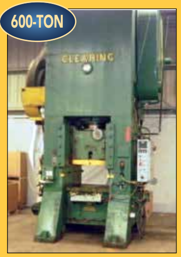
CLEARING STRAIGHT SIDE PRESS