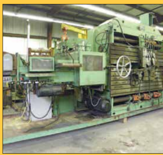
S/8" REFELINGHALIS MOL. SRP