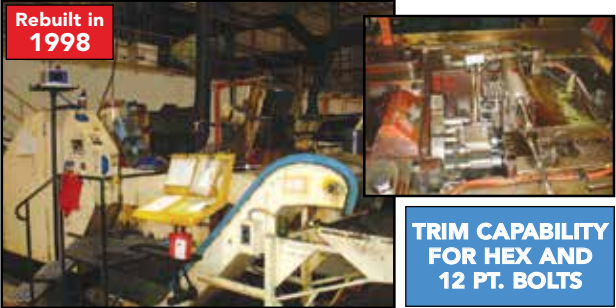
1/2" NATIONAL 89, 2 DIE 3 BLOW