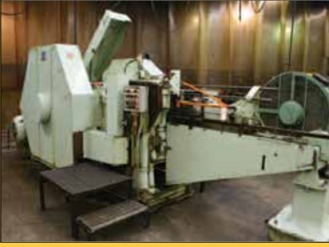
1/2" WATERBURY #33 DSOD