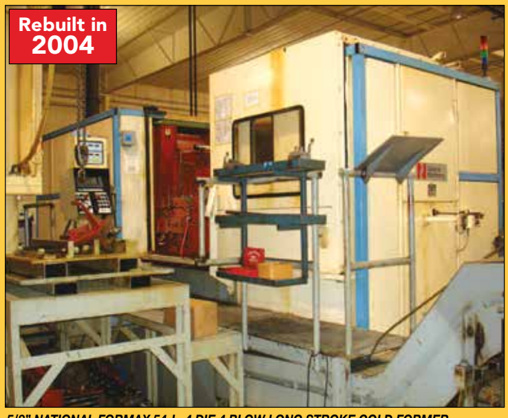
5/8" NATIONAL FORMAX 54-L, 4 DIE 4 BLOW LONG STROKE COLD FORMER

FEATURING: Well Maintained National Cold Parts Formers up to 1", Formax Long Stroke Multi-Die, Boltmakers, Many 2 Die 3 Blow Headers, Medium and Long Stroke Single Die Cold Headers, High Speed Thread Rollers, some with Washer Assembly Systems, Bolt Trim Presses, In-Line Wire Drawers, Automated Late Mdl. Fastener Washing System, Air Cleaning Systems and Much More!