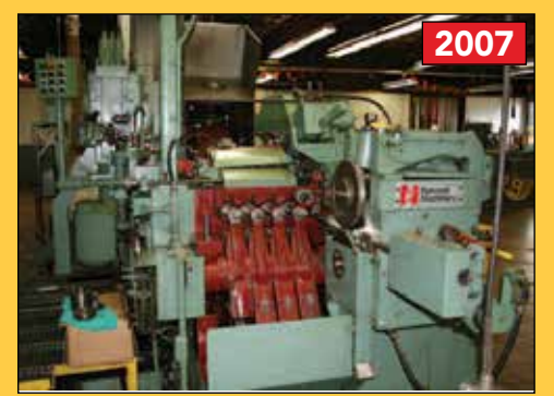
NATIONAL S-3 4 DIE BOLT MAKER

Manufacturer of Special Multi Die Cold Formed and Long Headed Parts