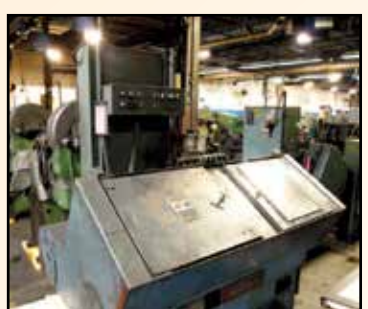
NATIONAL THREAD ROLLERS