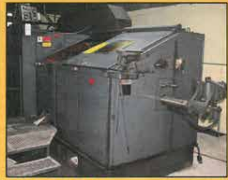
56-S1 NATIONAL 2 DIE 3 BLOW