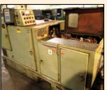
NAKASHIMADA 2 DIE 3 BLOWS