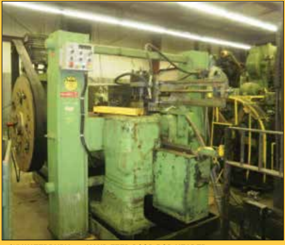
5/8" WATERBURY #44 HAND FEED DSOD ROD HEADER