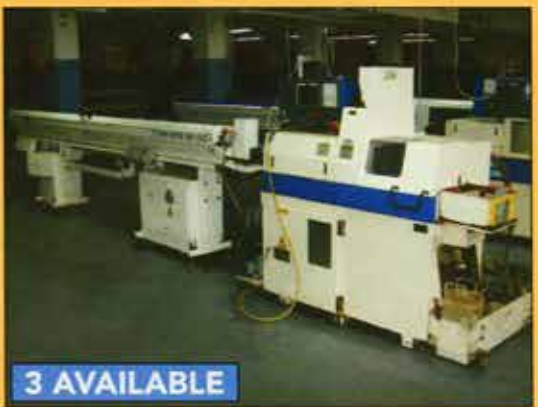
TSUGAMI CNC SCREW MACHINES