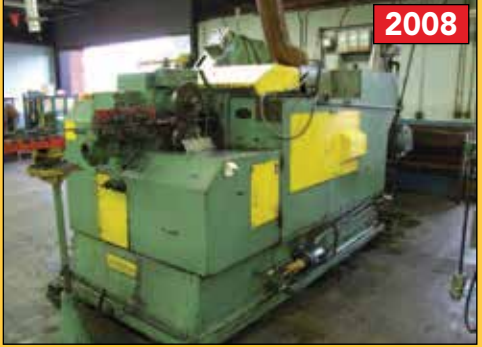
ASAHI-OKUMA 2 DIE 3 BLOW COLD HEADER