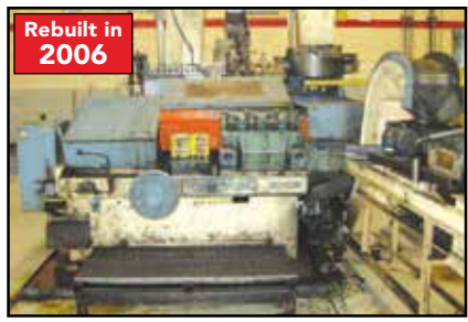
5/8" HARTFORD 30/40-180