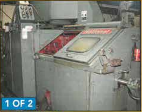
34 NATIONAL 2 DIE 3 BLOW