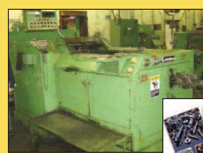
Asahi Okuma 8XL 2D2B